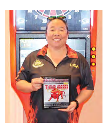
3rd/4th Tie Top Gun Women's A/AA Singles