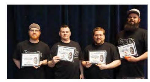
1st Open Team E Div Scoots